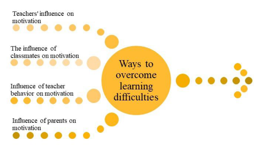
Figure 3. Ways to overcome learning difficulties

While researching pupils with special needs learning motivation opportunities it was necessary to find out about their learning environment (Table 3). Good relationships between pupils and teachers, pupils and classmates at school encourage pupils' willingness to learn and positively affect learning outcomes and progress. Most like working with peers. Teachers help and hear pupils with special educational needs.