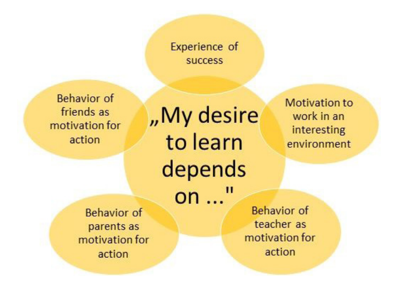
Figure 1. Motives to encourage pupils with special educational needs activities

Factors motivating pupils with special educational needs. Five qualitative categories have been identified (Fig. 1): 1) motivation to work in an interesting environment; 2) success experience; 3) behavior of friends as motivation for action; 4) parental behavior as motivation for action; 5) Teacher's behavior as motivation for action.