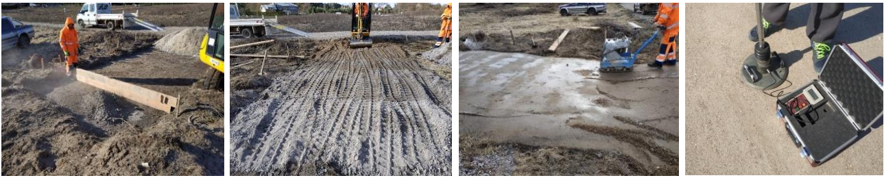
Figure 2. Construction process and measuring of compaction quality of frost-resistant base layer

The test was performed in March 2019. Air temperature was 5-6 degrees above zero. The gravel/ash mixtures (P1-P5, Table 2) were prepared and the base was formed with a mini excavator JCB 8016 (weight 1.6 tons). The surface of the formed layer was levelled by hand. After excavation, the bed bottom was vibrated with a Webwr vibrator (weight 200 kg). Ground compaction depth was at least 40cm. After vibration, the bottom of the trench was divided into five equal parts, where mixed ash and gravel substrates were laid in different proportions (Table 2).