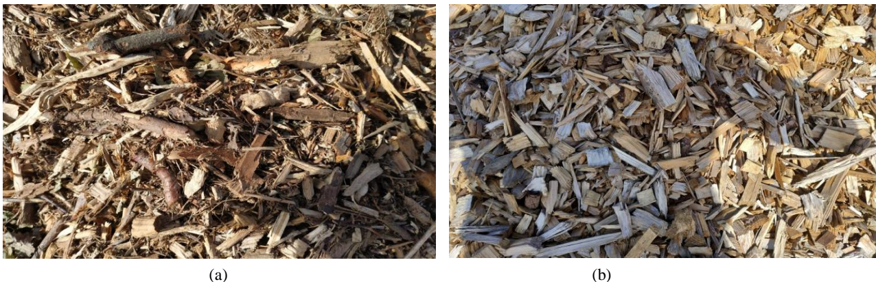
Figure 3. Different wood biomass burnt in “Inkaras” power plant: a) waste wood chips from Lithuania; b) wood chips from Belarus

Biomass boilers can burn a variety of fuel - not only traditional firewood or straw, but also other types of biomass. All these fuels are considered as renewable energy sources and, according to an international agreement, CO 2 from the combustion of such fuels is not considered to be a greenhouse gas. According to ISO 17225-1:2014 (2014), solid biofuels depending upon their origin are classified into: wood biomass (forest, plantation and other untreated wood; by-products and wastes from the wood processing industry, etc.); herbaceous biomass (agricultural and horticultural herbaceous biomass; by-products and waste from food and agro-processing industry, etc.); fruit biomass (fruits from orchards and horticulture; by-products and waste from fruit processing industry, etc.); biomass mixes and blends . The biofuel boiler plant “Inkaras” (Kaunas) uses both local wood biomass, also biofuel obtained from Belarus (Figure 3).