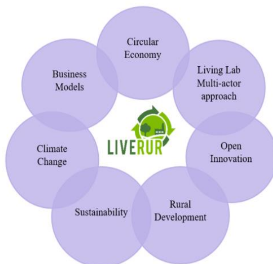
Figure 1. LIVERUR concepts (LIVERUR 2019)

Within a first step, important topics from the LIVERUR project were collected (see Figure 1) and then narrowed by a criteria and indicator system for its practical applicability. Due to Marker (2011) a criteria and indicator system should be specific, measurable, applicable, sensitive, available and cost-efficient. The new system should cover all relevant topics, but avoid overlapping and double evaluation. As a great number of various criteria already exists, it is not necessary to develop new indicators, but to identify the most appropriate ones for the LIVERUR project purpose.