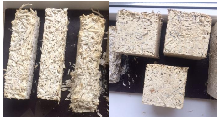
Figure 1. Curing of the specimen in the open air.