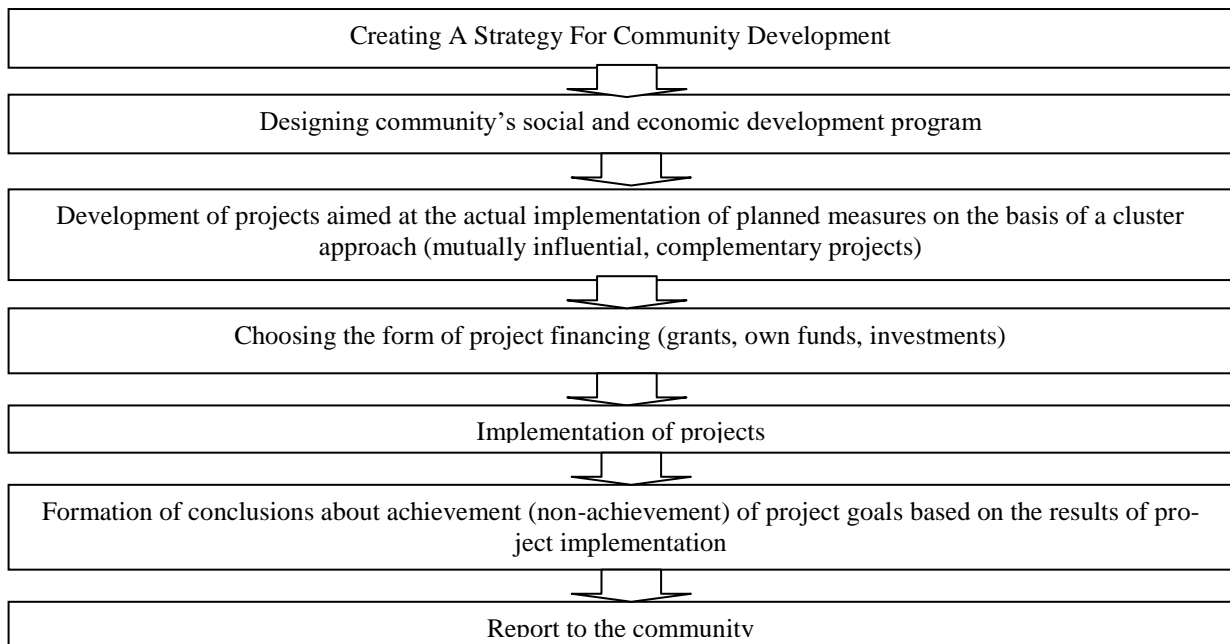
Fig. 2. An algorithm for a cluster approach in administering a territorial community

Proposed cluster and creative approaches in administration will allow to take into account the socio-psychological and ecological-economic consequences of making managerial decisions as much as possible. Indicators of the effectiveness of this activities are availability of clean water and air in the long run, soil fertility and the health of the nation as a result of harmonization of human and natural relations, achievement of such economic results as raising the level of employment and welfare of the population (mainly due to self-employment), and as well as rising levels of food and economic security of families.