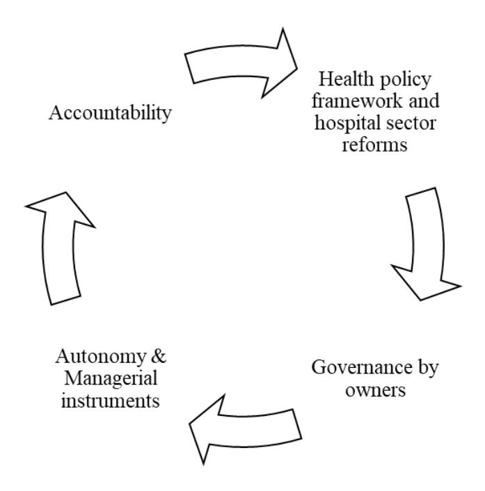
Fig. 2. Institutional arrangement factors

Based on Fidler et al. (2007), the authors also summarized significant factors for institutional arrangements of university hospitals to be considered during future developments (see Fig. 2).