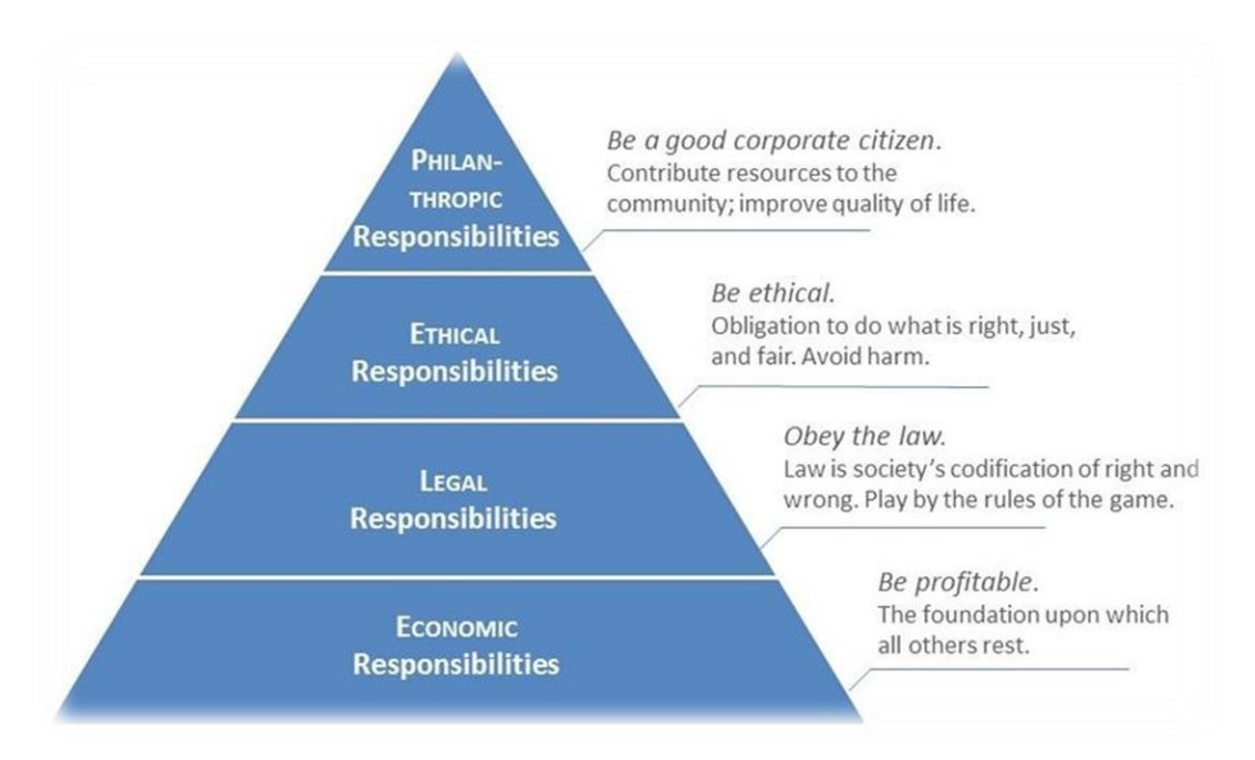
Fig. 1. Pyramid of corporate social responsibility levels

Article DOI: https://doi.org/10.15544/mts.2019.23