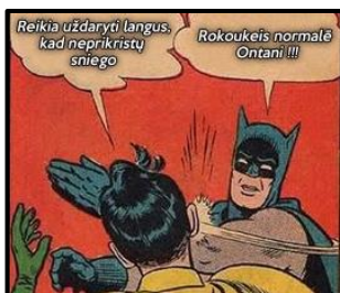
Pic. 1. Reaction to SL

Samogitians who comment on the abovementioned images share a similar point of view. For example, people tag their friends under such posts and ask them not to forget the normal language (meaning Samogitian) when they come back after studying in other cities of Lithuania. This shows that there is antagonism between Samogitians and Aukštaitians when it comes to how they perceive what the most acceptable code for communication is. Either side sees their variety as normal hence prestigious, which places the other variety in the reversed position. Therefore, when Samogitians switch to using the SL, fellow Samogitians sometimes feel like slapping them, 'is kart nuors y i kram dout' [Eng. There's an urge to hit someone's head]. Moreover, a rather commonly expressed idea suggests that if a Samogitian does not speak or understand the dialect, s/he is a poor Samogitian or not a Samogitian at all.