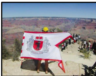
Pic. 2. A proud Samogitia