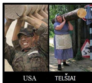
Pic. 3. A strong Samogitian

As Samogitians report, they are so much in favor of their dialect that they put up public signs in it as well. It suggests that there is an opposition between Samogitian and the SL in the public domain; Samogitian takes place of the SL to perform various functions that are typically fulfilled only by the SL. The domains where the dialect is used are expanding from bottom-up, so this could be interpreted as a shift in Samogitians' perceived value of their dialect. They do not believe that it is suitable only for the private domain anymore. However, this cannot ensure that people will speak Samogitian in those areas where these signs appear. For example, one Samogitian claims that she lives in the middle of the region but people in her area only speak the SL. Conversely, quite a few