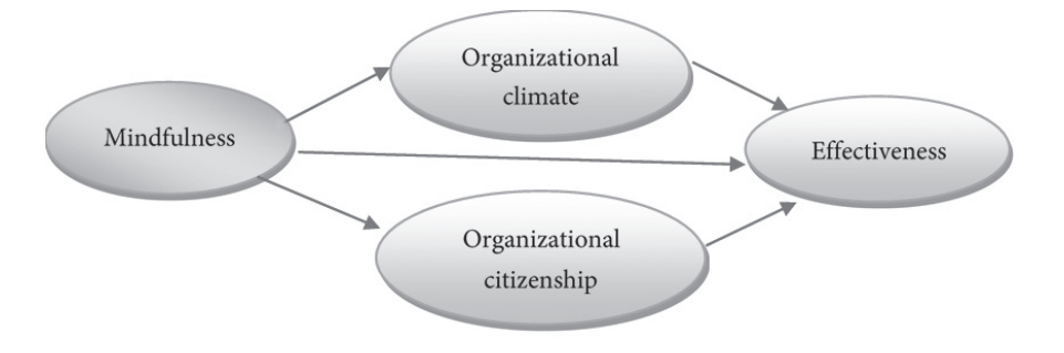
Fig. 1. The hypothesized pattern of the research

Examining the overall results of studies conducted in the field of the variables of this study, the main issue of this study is that the relationship between mindfulness and the effectiveness of schools, whether directly or indirectly, through the impact of mediating variables of "organizational climate" and "OCB" has not been empirically investigated. Therefore, this study aims to investigate the relationships among the variables studied and fit the proposed model of researchers. In order to achieve this goal, we tried to investigate and clarify the structural pattern of the direct and indirect impact of mindfulness on the effectiveness of schools through extensive studies in this field and appropriate selection of mediating variables. Therefore, based on literature and background studies, the hypothetical model of the research (Figure 1) was mapped and data collected and then analyzed by the structural equation model to confirm or reject it. It should be noted that the conceptual framework of mindfulness is based on Langer's theory modified by Weick and Sutcliffe and used by Hoy (2003) in empirical studies.