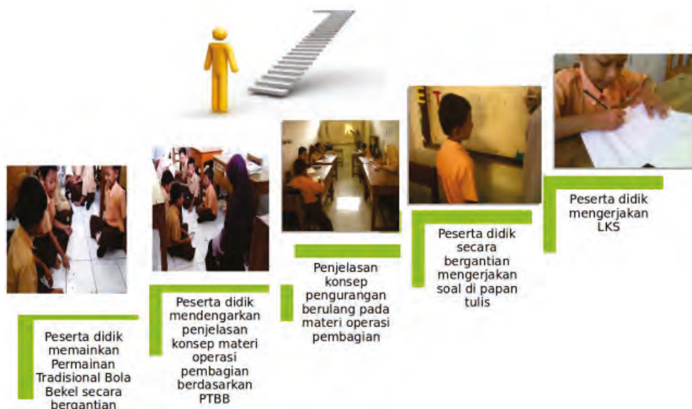
Fig. 3. One of the student's learning design for her research

Learning trajectory which has been designed in Figure 1 is the activity undertaken in this study to guide students doing research and writing scientific paper as a their research result by using research-based learning. So that, researcher designed an activity that make students review journal and find “hot” issue in mathematics education. This activities start from dividing all students into 7 groups and conduct research independently. The goal is that students are able to design learning trajectory for their research (Figure 3).