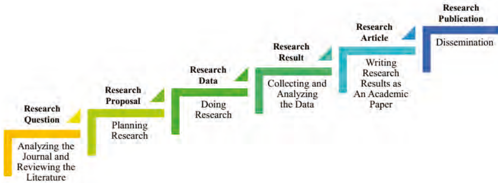
Fig. 1. The Hypothetical Learning Trajectory on Research in Mathematics Education