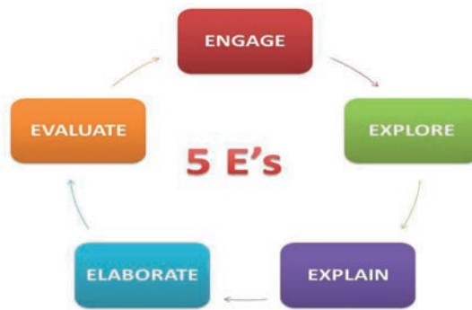
Fig. 1. 5E model

A three-stage learning model was developed an applied in experimental activity. It is called 5E model (Engage, Explore, Explain, Elaborate, Evaluate). Unlike traditional models 5E model aims to encourage students to obtain concepts and principles from science-based experiments and researches. As a result students acquire not only content knowledge but also important cognitive process skills such as critical reasoning and problem solving. This model (Figure 2) consists of 5 learning phases – engage, explore, explain, elaborate, evaluate.