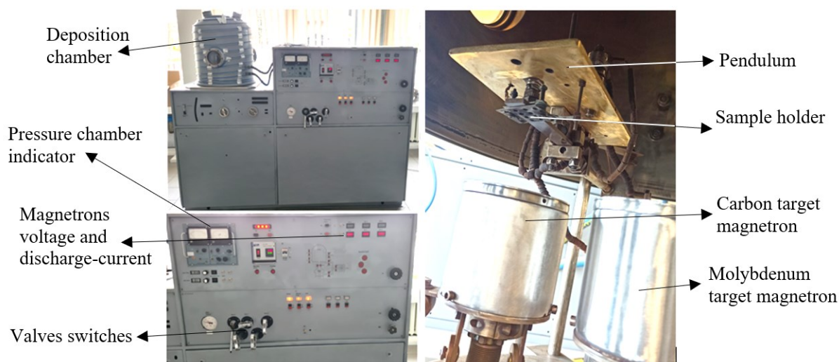
Figure 1. The photo of magnetron deposition system, control panel with the main elements (left) and deposition chamber (right).

In this work, the direct current magnetron sputtering technique was used to deposit the DLC and Mo-DLC thin films using graphite and molybdenum cathodes. The deposition was done on two copies of silicon (100) substrates. Prior to formation, an argon plasma cleaning was used to the surface for 10 minutes to remove the contaminations and activate the surface. Argon was used as sputtering gas and the distance between the Si substrate and targets was set to 6 cm and the deposition time was 600 s for all samples. For the DLC film the discharge current of the graphite target was fixed at 1.5 A, while the Mo-DLC samples the discharge current of the graphite and molybdenum targets were fixed at 1.5 and 0.25 A, respectively. A shield mounted above the Mo target was used to change the molybdenum amount in the Mo-DLC films by changing the opening of a rectangular slot in this shield. The slot opening started with 4 mm until 32 mm. The deposition system used for the formation of films is shown in Figure 1, where the substrate was moving above the targets back and forth at the same altitude.